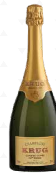
"MAGICAL COMBINATION OF EXTREME COMPLEXITY, TEXTURE AND FINESSE"