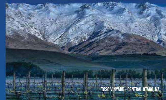
TOSQ VINEYARD - CENTRAL OTAGO, NZ

Until recently Giant Steps have made only single vineyard wines, but the new Yarra Valley range is made from handpicked fruit from all of the estate vineyards. The wines are produced using indigenous yeasts, gravity-flow winemaking, and minimal fining and filtration. This approach produces highly expressive wines, true to the regional characteristics of the Yarra Valley.