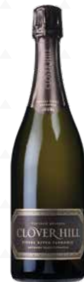
"A POWERFUL WINE", JAMES HALLIDAY

Of course Champagne is the king of sparkling wines and James Halliday has given us a list of famous big names as well as some lesser known, highly respected houses which fly 'under the radar.'